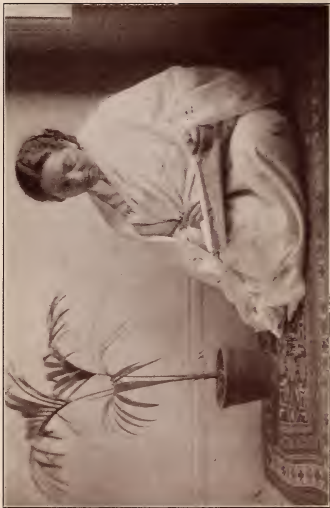
Ramabai at work on her translation of the Bible into popular Marathi